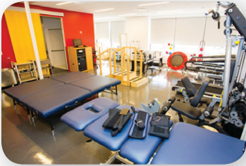
Orange County Campus 1200 North Magnolia Avenue Anaheim, CA 92801 (714) 763-9066