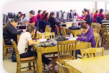
ACC at St. Francis Lynwood Campus 3680 East Imperial Highway 5th Floor Lynwood, CA 90262 (310) 900-8050